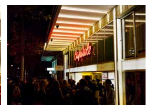
Actress Tania Mallet on location in Switzerland for Goldfinger The Capitole cinema