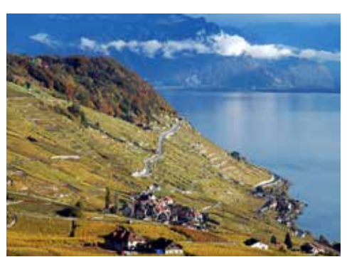
The Lavaux vineyards near Lausanne