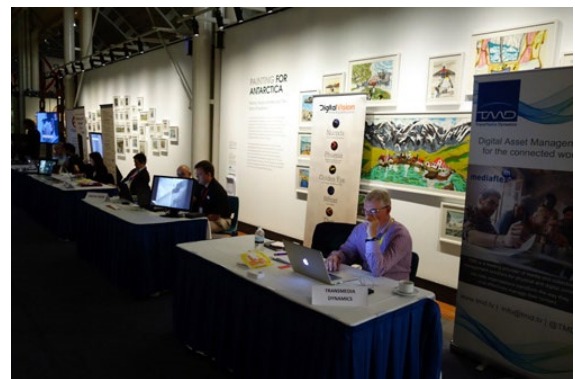
Exhibitors' stands at recent FIAF Congresses.