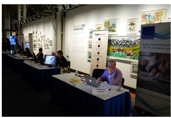
{\bf Exhibitors'\, stands\,\, at\,\, recent\,\, FIAF\,\, Congresses.}