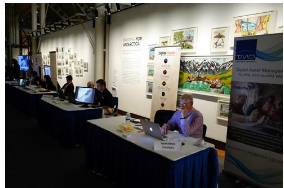
Exhibitors' stands at the FIAF Congresses in Beijing (2012), Barcelona (2013), Skopje (2014) & Sydney (2015)