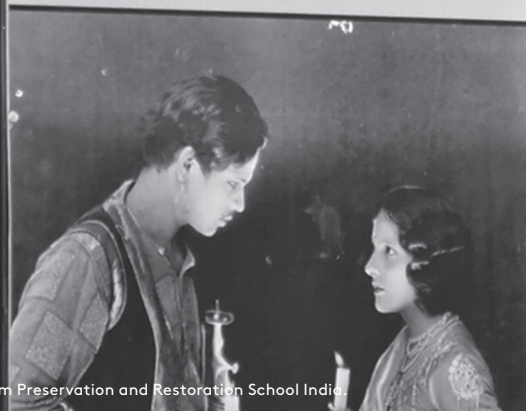
Indian film star Amitabh Bachchan addresses the students of the Film Preservation and Restoration School India.