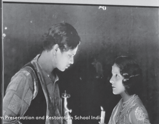
Indian film star Amitabh Bachchan addresses the students of the Film Preservation and Restoration School India.