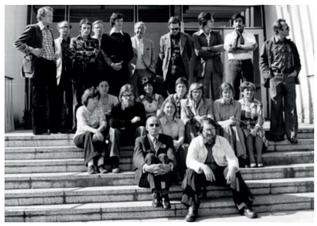
1976 FIAF Summer School

abandon the policy of secrecy and not to think of FIAF and the archives as a kind of secret society. Those were certainly two matters of major importance to me in those days. But I didn't join with a particular programme in mind.