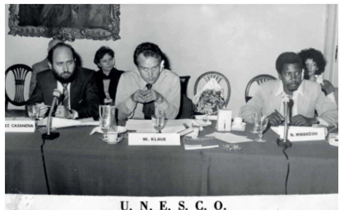
REUNION DE EXPERTOS PARA LA PRESERVACION DE FILMES